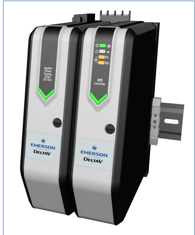
The MQ Controller.

Mounting. This plug-and-play system structure provides modular system growth with a single controller and can be mounted in a Class 1, Div 2 or ATEX Zone 2 environment. Refer to the System Power Supplies and I/O Subsystem Carriers product data sheets for additional information.