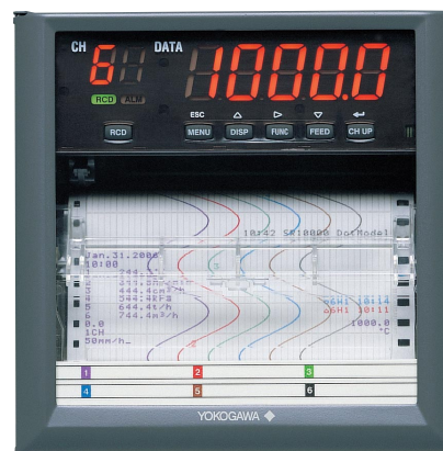
SR10000 (6 dot model)

The SR10000 can be used as a monitoring device and as a quality control instrument in many applications (such as process temperature monitoring, pollution, construction, furnaces, field of medical diagnosis, field of refrigerating, etc.).