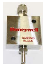
Gassing Block 316SST