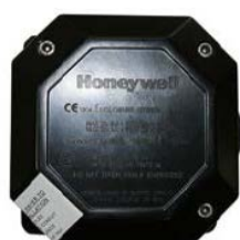
Honeywell Junction Box