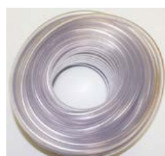
Soft PVC Tubing 8mm O/D x 5mm I/D 90068-C-8292