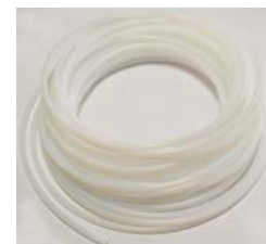
PTFE Tubing 8mm O/D x 6mm I/D 90068-C-8291