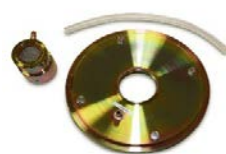
Duct Mounting Kit