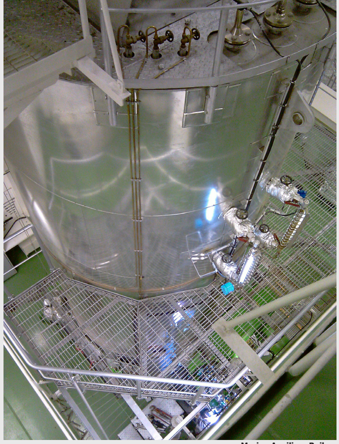
Marine Auxiliary Boiler

The MSRS (see next page) provides a known quantity of oxygen internal to the sensor, meaning a supply of reference gas or fresh ambient air is not needed. The sample is drawn into the sensor via a Pitot effect created in the sample probe and vented back into the stack. This means for most applications there is no need for an aspirator (eductor) air supply, saving ongoing cost (unless the back flush option is required for extremely dusty applications).