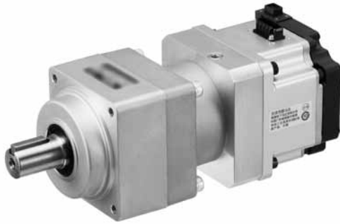
MQMF 100 W to 400 W