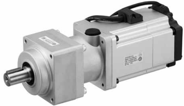
MHMF 100 W to 750 W