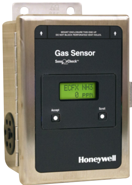
EC-FX-NH3 with Stainless Steel enclosure and LCD options

Proprietary technology for longer life and lower costs