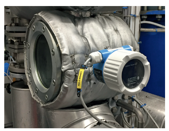
Application for bleaching edible oils

The Special Refining Company (SRC) in Zaandam, the Netherlands, refines high-quality edible oils for a wide variety of customers. The quality of the oil must comply with the HACCP global standard for food.