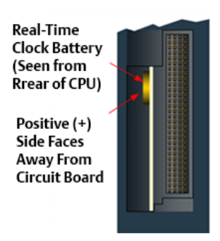
Figure 1: Real-Time Clock Battery

There are no diagnostics or indicators to monitor RTC battery status. The RTC battery has an estimated life of 5 years and must be replaced every 5 years on a regular maintenance schedule. If the RTC battery fails, the CPU date and time is reset to 12:00 AM, 01-10-2000 at startup. The CPU operates normally with a failed or missing RTC battery; only the initial CPU Time-of-day (TOD) clock information will be incorrect