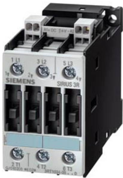
CONTACTOR, AC-3 5.5 KW/400 V, DC 24 V, 3-POLE, SIZE S0, CAGE CLAMP